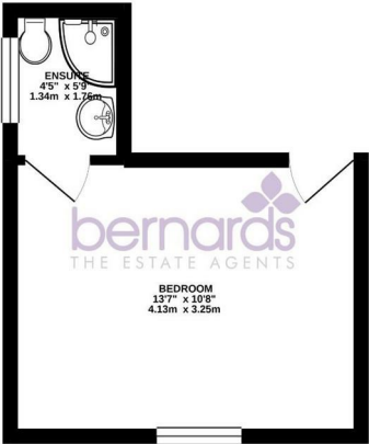
TOTAL FLOOR AREA: 170 sq.ft. (15.8 sq.m.) approx. While every attempt has been made to ensure the accuracy of the floor plan, measurements are approximate and should not be relied upon for any purpose other than a general guide. The actual area may vary slightly from the measurements shown. The floor plan is not to be used for any other purpose without the written consent of the agent.